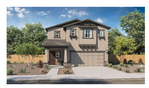
B - Craftsman