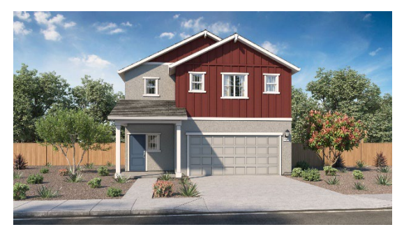
A - Farmhouse

886 PICO PLACE, CHICO, CA 95973 | DRHORTON.COM/SACRAMENTO