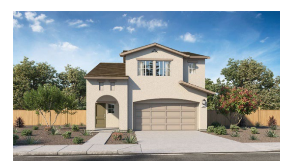
C - Mission